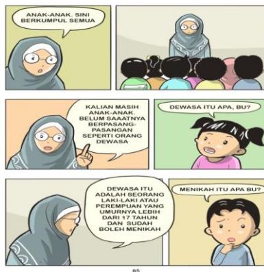
Figure 3 Smart Information

BUSAPAKSA design contained CSA material in story approach. Rahmawati (2012) says that an accurate social story strategy, which describes situations and pure comic conversation by using visual symbols, abstract conversational concept and columns which indicate emotional content, can improve the students' understanding on sexual education. BUSAPAKSA consisted of seven stories, which were as follows: (1) recognizing and maintaining My body parts; (2) Recognizing Family Members; (3) Computer and Internet Learning; (4) Recognizing the Police Offices; (5) Going to the Zoo; (6) Fishing in the River and (7) Being Adult Game